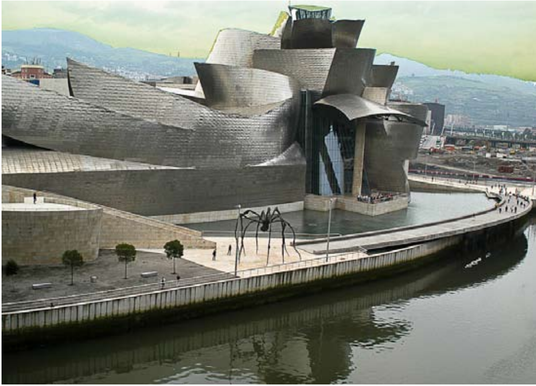
Frank Gehry's Guggenheim Museum