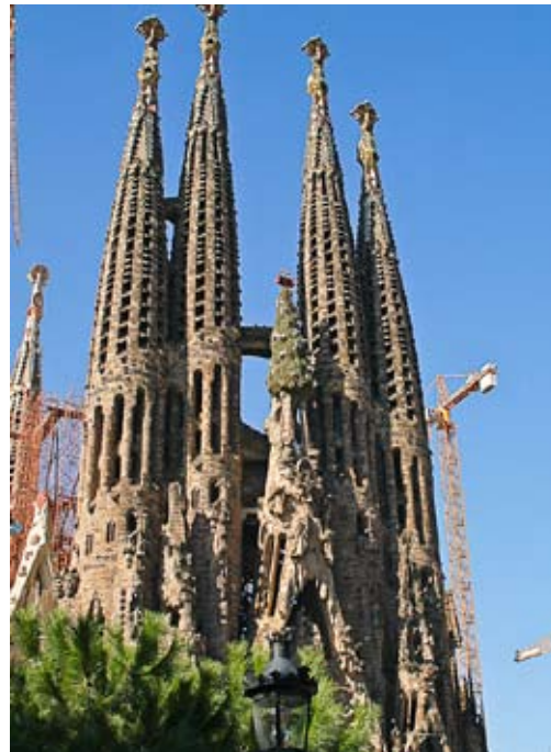
Antoni Gaudi's Sagrada Familia cathedral