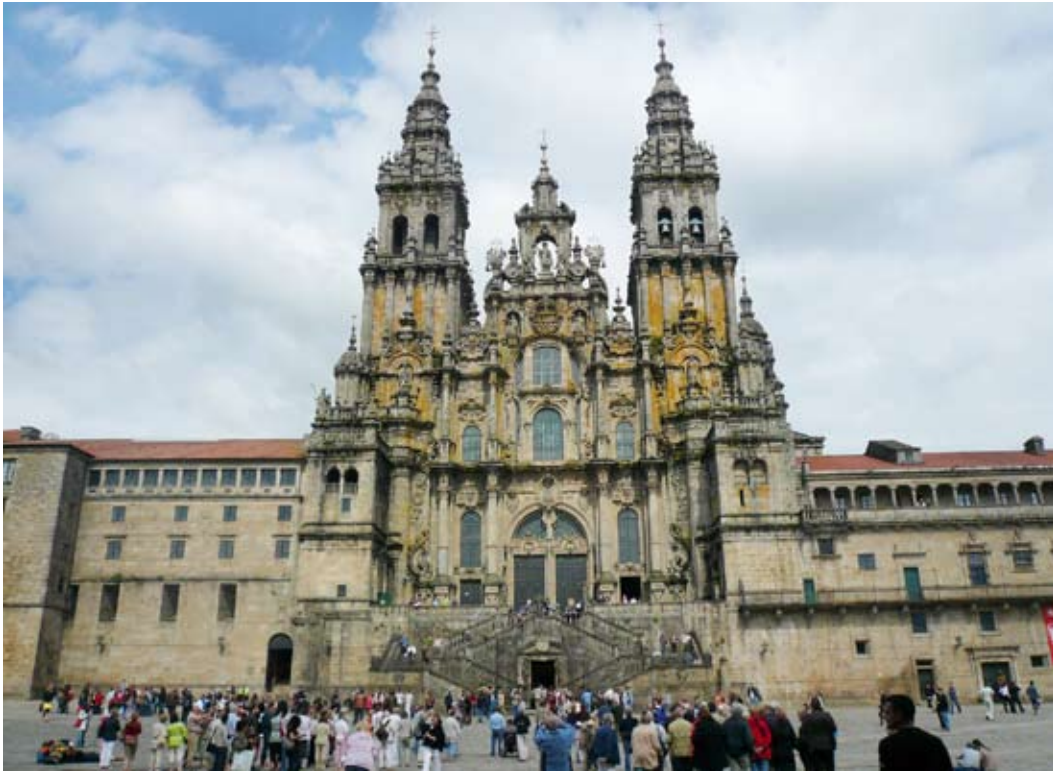
The cathedral in Santiago de Compostela

We stop in La Coruna to travel inland to visit Santiago de Compostela, Europe's third most important pilgrimage site after Jerusalem and Rome. For hundreds of years pilgrims have traveled the 443-mile pilgrimage trail that begins in northern France and concludes at the city's magnificent cathedral which contains the tomb of St. James. Also on the square is the town hall and the Hostal de los Reyes Catolicos, a great parador dating to the time of Ferdinand and Isabella. The granite streets of the old center and the city's monuments together have been designated a UNESCO World Heritage Site.