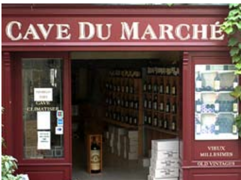
A wine shop in Bordeaux

The fifth largest city in France (and a UNESCO World Heritage Site) Bordeaux is the handsome capital of the famed Bordeaux wine region. Noted for its attractive 18 th Century architecture and its automobile-free inner city, walkers will love Bordeaux's old center. Of course every visitor should take part in one of the ship's excursions to the wine village of St. Emilion and visit one of the countless wineries in the region. It's great that the ship stops in Bordeaux for two full days.