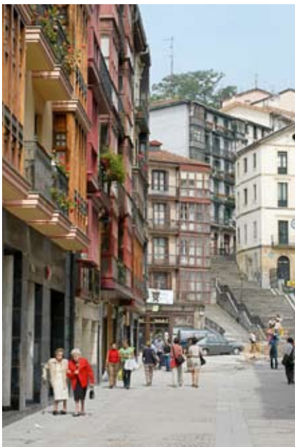
Casco Viejo (Old Town Bilbao)

Once an industrial center of Spain's Basque region, Bilbao's city father convinced New York's Guggenheim Museum to build their European modern art center of in their city. As the incentive to locate the museum in Bilbao, they agreed to finance the construction of an a magnificent structure designed by architect Frank Gehry. Wait until you see the silvery, curving titanium walls unlike anything seen before. Also while in Bilbao, don't miss the handsome rows of townhouses lining the streets of the Casco Viejo, or "Old Town".