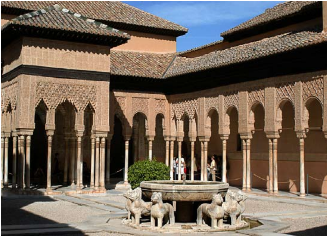
Courtyard of the Lions, The Alhambra