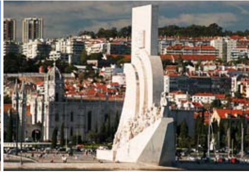
“Henry the Navigator”