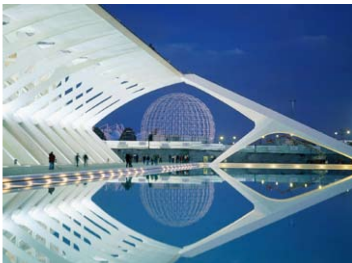
Valencia's City of Arts and Sciences